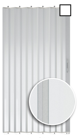
Clearfold [clear acrylic panels]