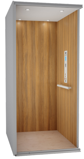
Karuna Ash Melamine