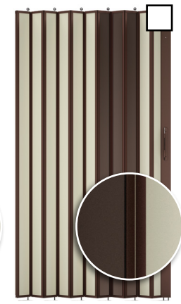
Panelfold Bronze [solid with 3 tinted panels]