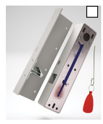
Porta Lock for home elevators<sup>1</sup>

for home elevators with 1¾" door; includes pine frame 80" wide by 36" or 42" wide; stainless steel spring hinges, Porta lock<sup>1</sup>